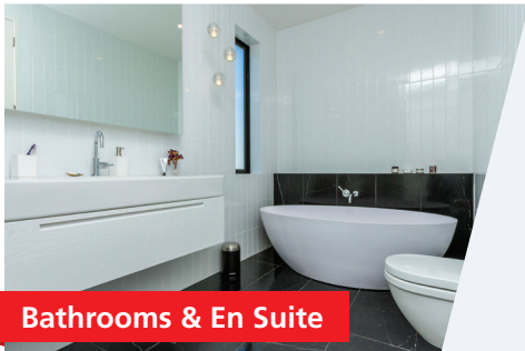
Bathrooms & En Suite